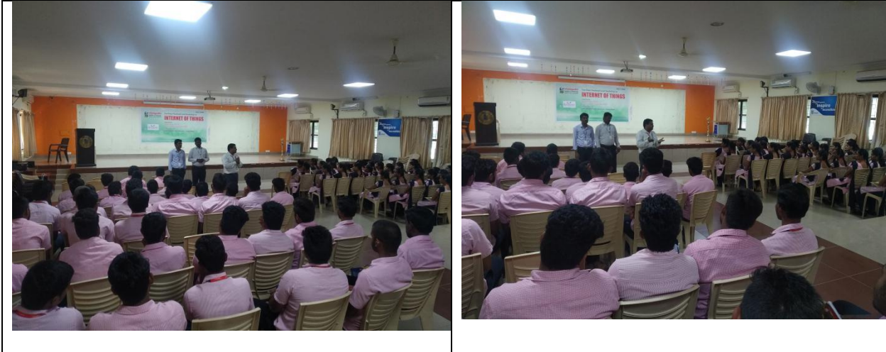
Photos of Two-day National-Level Workshop on Internet of Things (IOT)